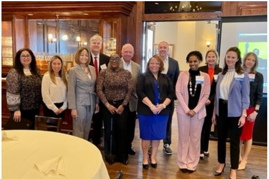
GAHE's Toastmasters group at the club's chartering ceremony at Maggiano's.