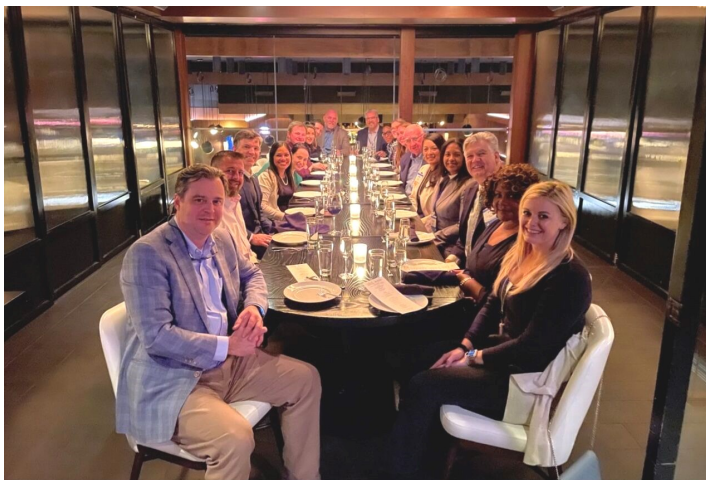
GAHE's Board Dinner at ACHE Congress in Chicago on March 19.