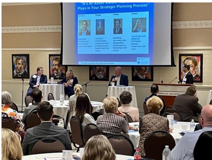
Afternoon panel session on strategic planning at GAHE's Summit on March 9 in Macon.